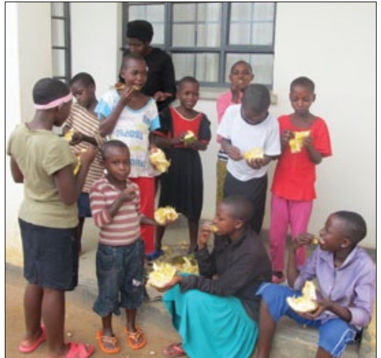
Recently admitted girls enjoy a snack of Jackfruit in front of their new home.

Think out of the box... look for new resources to support HMI's mission. Talk to friends and family...tell them what we're up to and why you think the Blue House is important. Bring them to an event. Look for business and civic groups