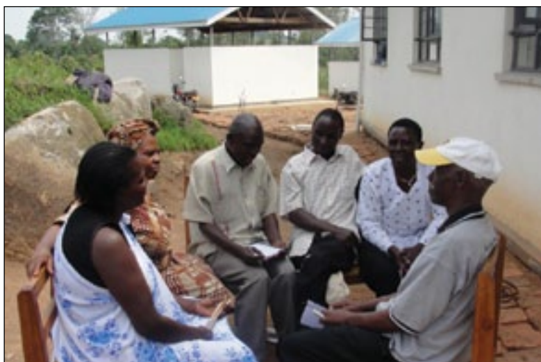
Board Meetings in Kazo are often held in the open air.