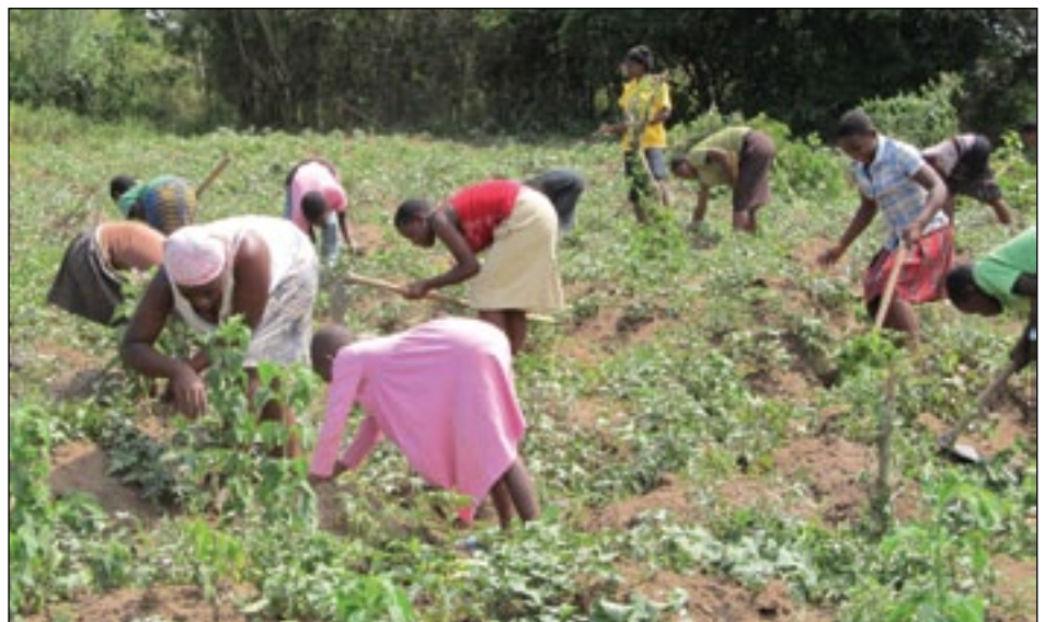
Hard at work in the Blue House shamba (garden) growing peanuts, sweet potatoes, cassava and corn.

attending a university. There, as here, training and education help in finding employment, but there are no guarantees and it takes time. H