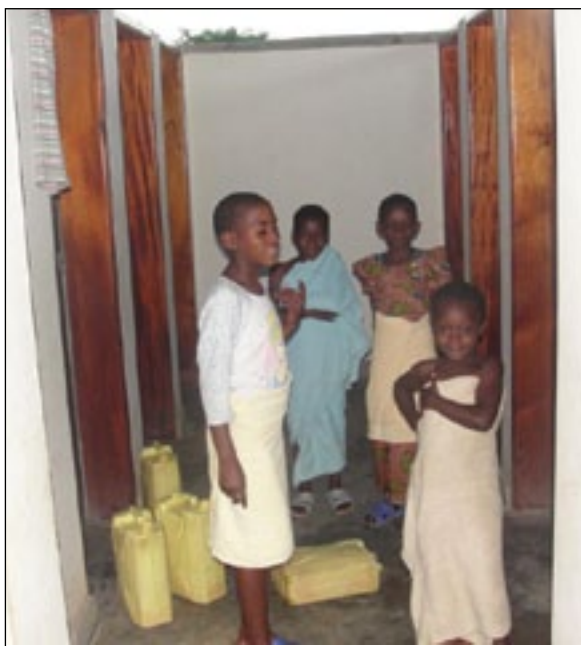
A shower makes a girl feel so nice!

The toilet building has 8 3- by 5-foot stalls with a 9- by 8-inch hole near the center of the stall. Toilet paper is located on a piece of plastic outside of every other stall. A wash basin with jug of water for hand washing was provided just outside of the building."