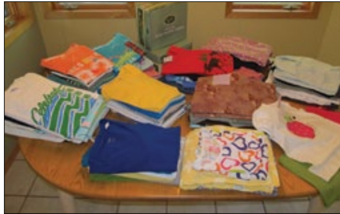
In one suitcase?