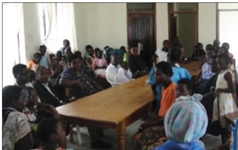
Orphans, their guardians, Board members and staff participate in the intake process at the Blue House.

"[Penlope] works with the girls, showing them how to cultivate the garden (now featuring corn, sweet potatoes, peanuts and cassava), prepare food, care for their clothes and clean and maintain the House, latrine, showers and laundry buildings on a schedule. As a university graduate, she models the importance of doing homework and getting a good education."