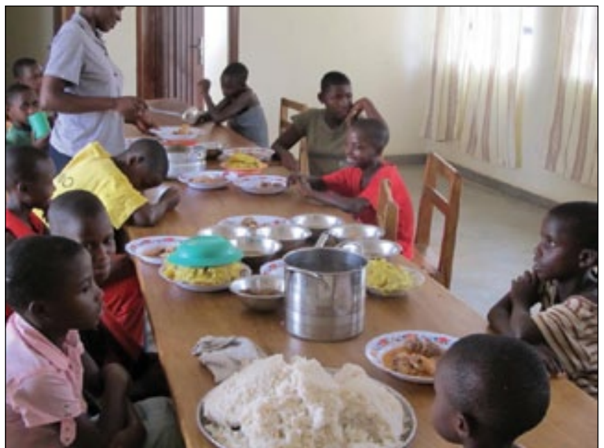
Dinner is served — lots of matoke and rice!