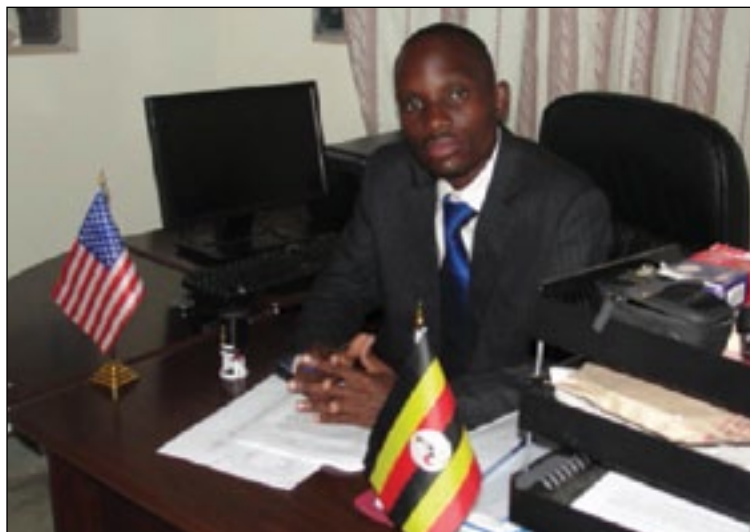
The director at his desk – working for Uganda and the USA.

The visible challenge at Blue House is the poor academic performance of some of the girls. The grades of some girls